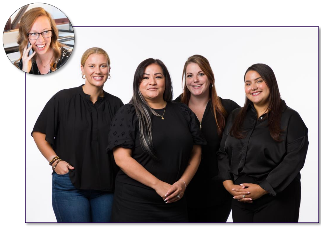
Members of our Care Concierge Team